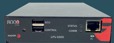
Portable control unit LPU-ETH 8000